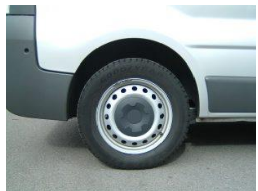
With air suspension