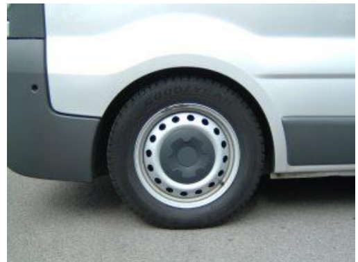
Without air suspension